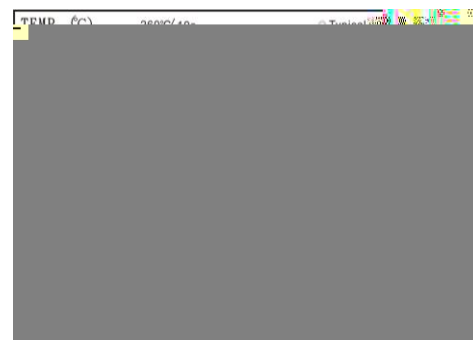
Wave Soldering (Flow Soldering)